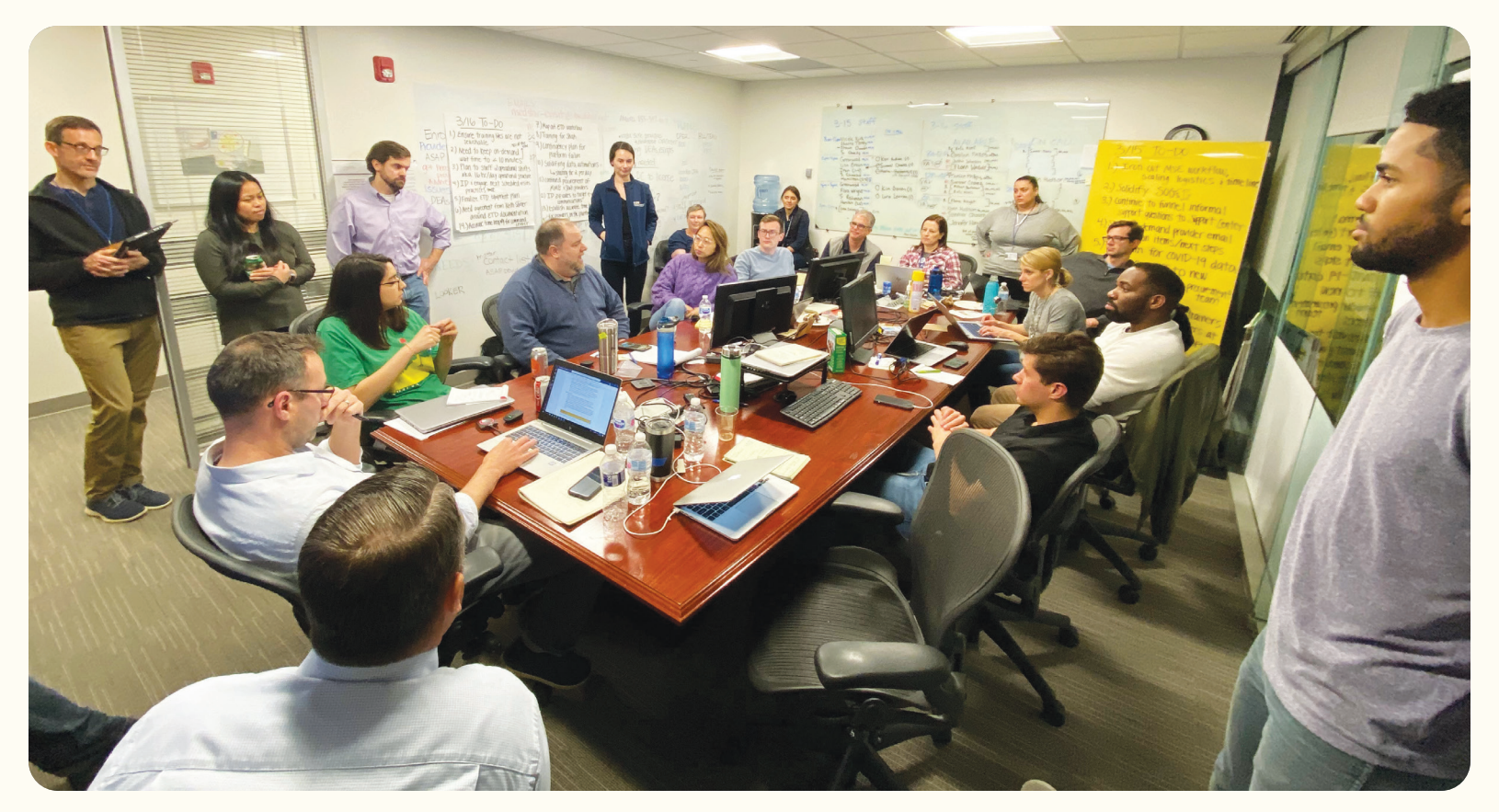
MI2 colleagues worked during the initial days of redeployment in mid-March, to ramp up MedStar telehealth. This photo was taken prior to the workplace requirement for proper PPE and physical distancing. All patients and providers are expected to follow the current MedStar Health guidelines for safety. Learn more at MedStarHealth.org/Safe.

providers who continued routine telehealth visits with her patients as the shelter-in-place was underway. She says telehealth has been good for her and her patients.